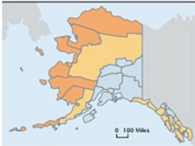
Figure 3. Largest Ancestry: 2000

(Data based on sample. For information on confidentiality protection, sampling error, nonsampling error, and definitions, see www.census.gov/prod/cen2000/doc/sf3.pdf )